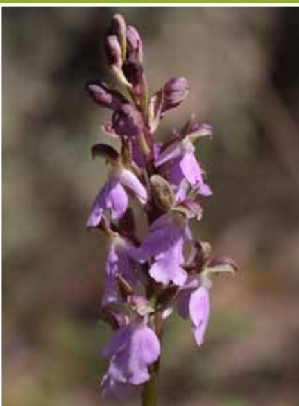
Left: Alpine swift Above: Orchis cazorlensis