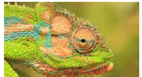
Cape dwarf chameleon

The Overberg farmlands and adjacent coastal areas are the haunt of South Africa's national bird, the blue crane, as well as being good country for raptors, such as jackal buzzard, martial eagle and secretary bird, and bustards.