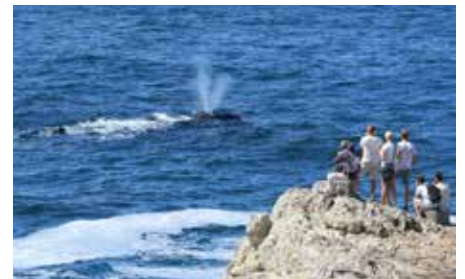
Whale watching at Hermanus

Hermanus is one of the best places in the world to watch whales close to land, southern right whales especially. At Cape Agulhas, the southern most tip of Africa, seabirds could include the tiny Damara tern.