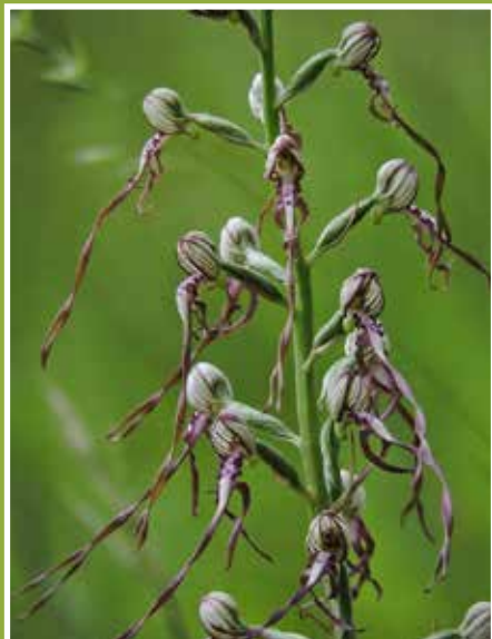
Lizard orchid Himantoglossum adriaticum