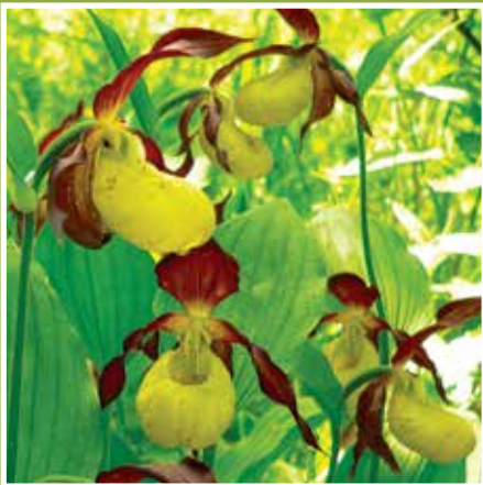
Lady's slipper orchids