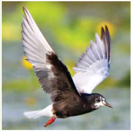
White-winged black tern