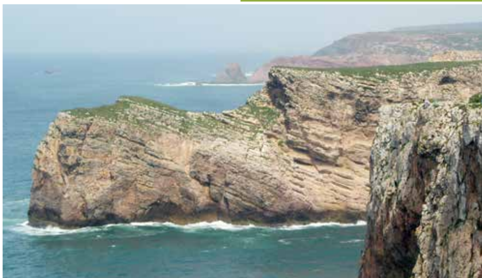
Cape São Vicente

More information visit www.honeyguide.co.uk 15