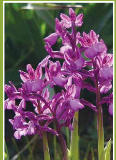
Orchis boryi - Spili