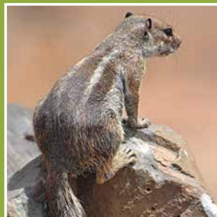
Barbary ground squirrel