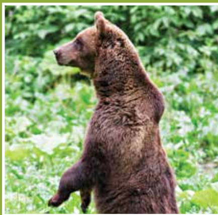
Brown bear, a highlight of the Carpathians

Leaders: Ibis team, with a local guide from Ibis in the Carpathians