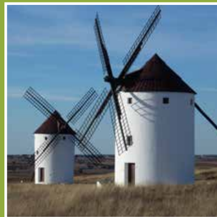
Don Quixote's windmills