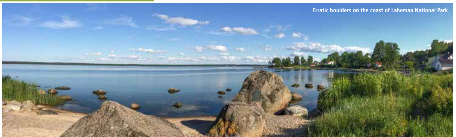
Erratic boulders on the coast of Lahemaa National Park