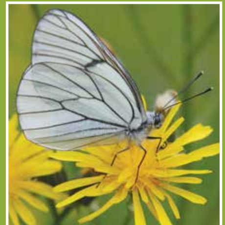
Black-veined white butterfly