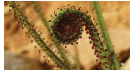
Lusitanian sundew Drosophyllum lusitanicum

Many flowers have adapted to take advantage of the mild winter, including asphodels, squills, Barbary nut irises, early Ophrys orchids, paperwhite narcissi and the strange-looking friar's cowl. Local species include Andalusian birthwort and – though not yet in flower – Lusitanian sundew, an unusual and very local carnivorous flower.