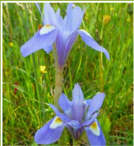
Barbary nut iris