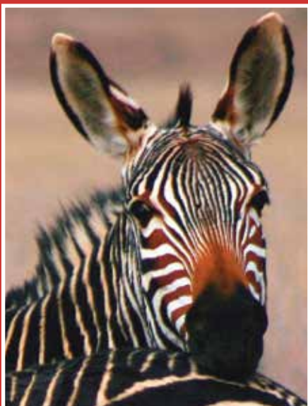
Cape mountain zebra