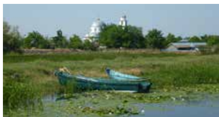
Approaching Letea Island in the Delta

Our local guides know the area and its wildlife well. But equally important is their hospitality. As the Romanian Ministry of Tourism brochure rightly says, 'Come as a tourist, leave as a friend'.