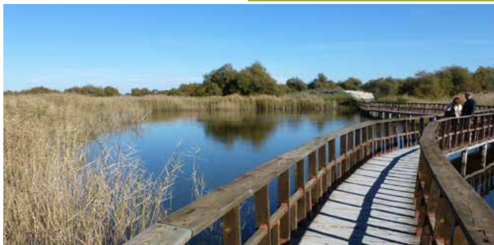
Las Tablas de Damiel National Park

More information visit www.honeyguide.co.uk 9